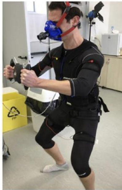
Figure 1. Training with CYFIT.

One further advantage brought by the Cyfit Smartgym training package is that it provides motivational-oriented audio-visual feedback with challenging and competitive games, encouraging the user to train more intensely. Although there presently are many applications that use games to increase physical activity, there has not been any such applications focusing to create measurable high-intensive strength training, designed to improve muscle development. Having real time training intensity goals can improve training results in a way difficult to reproduce. In addition, the utilization of full-screen Smart graphs depicting multiple parameters (both health status-directed and current training session-directed) further enhance motivational mindset within the individual user for self-analysis and self-development for his/her strength training journey.